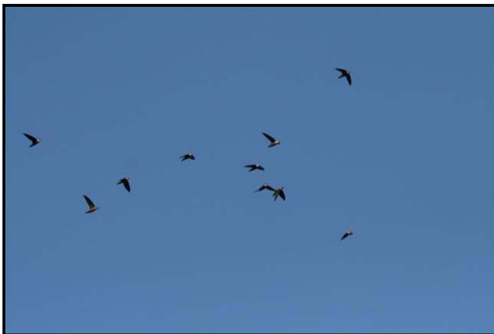
Chimney Swifts over the Stewards residence at Chaetura Canyon Sanctuary